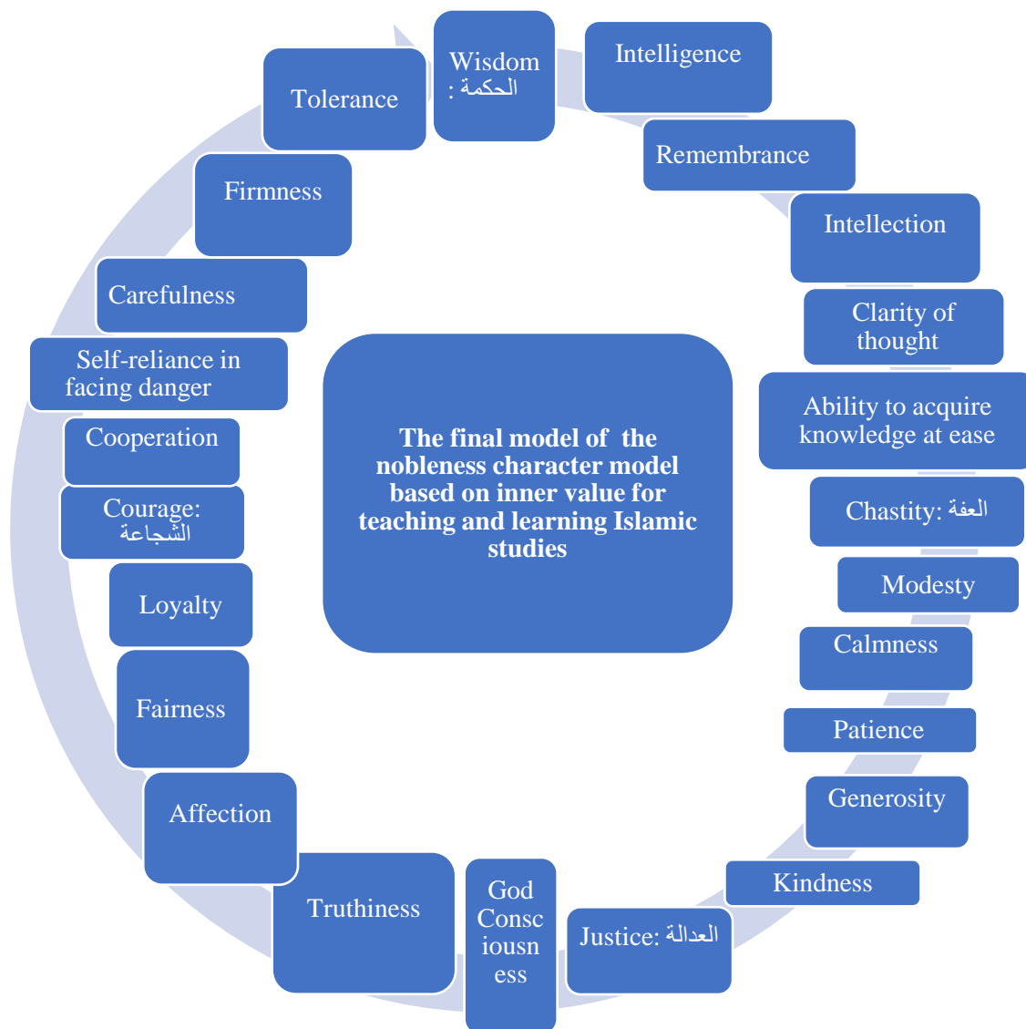
Figure 2. The preliminary design and development of the nobleness character model based on inner values for teaching and learning Islamic studies