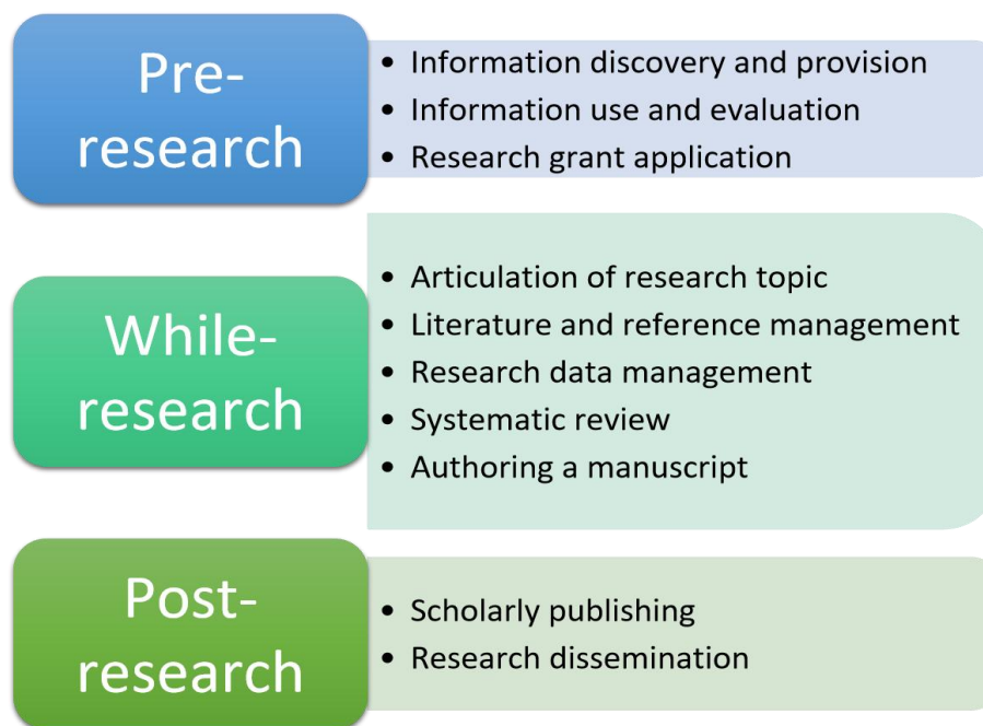
Figure 1: Academic Librarians' Potential Roles in a Research Partnership

Ten themes emerge as the roles of academic librarians in a research partnership, presented in three primary phases, namely pre-research, while research, and post-research, as illustrated in Figure 1.