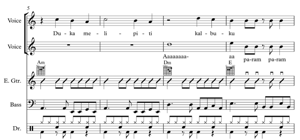
Figure 8: The different lyrical theme and syllables such as 'aaaaa' and 'pa-ram pa-ram' in Tak Mengapa by A. Rahman Hassan & Orkes Nirwana (1966) (Transcribed from source: A. Rahman Hassan & Orkes Nirwana, 1966, NFEP 5007)

A. Rahman Hassan's rendition of the song with the band Orkes Nirwana (see Figure 8) is a slowed-down ballad with Malay lyrics on the theme of heartbreak. Notably, this version includes the addition of background singers, likely musicians chanting nonsense syllables (non-lexical vocables) like 'aaaaa' and 'pa-ram pa-ram'. In this