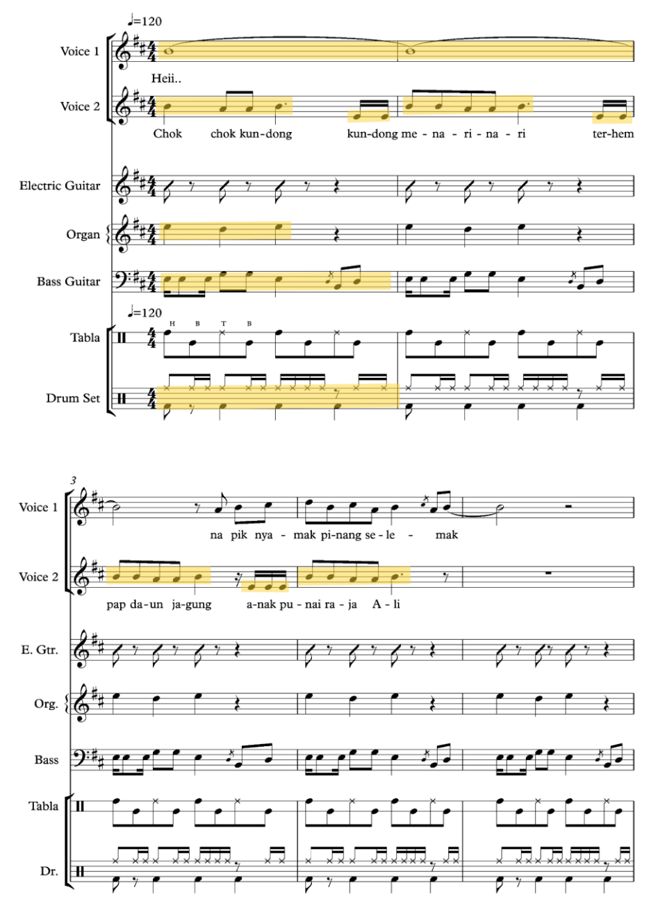
Figure 9: The overall arrangement of Chok Chok Kundong by Mike Ibrahim & The Nite Walkers (1971) (Transcribed from source: Mike Ibrahim & The Nite Walkers, 1971, S-EGEP 713)