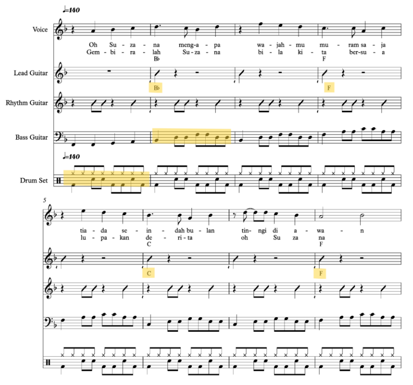
Figure 4: The overall instrumentation, chord progression and surf rock rhythm used in the chorus of Suzana by M. Osman (1964) (Transcribed from source: M. Osman & The Mods [1964, TK1003])

The majority of early Pop Yeh Yeh singers took cues from Western pop styles. They were especially influenced by renowned instrumental bands like The Shadows (UK) and The Ventures (US) (Rasheed & Saat, 2016). The song Suzana by M. Osman & The Mods is widely regarded as the first Malay pop song, according to the article Mengenang Kembali Pelopor Lagu Pop Melayu by Rosie Hashim (1976). Its composition and performance were centred on the use of the Malay language. However, it also incorporated musical elements from Western rock and roll as shown in the highlighted sections in Figures 4 & 5.