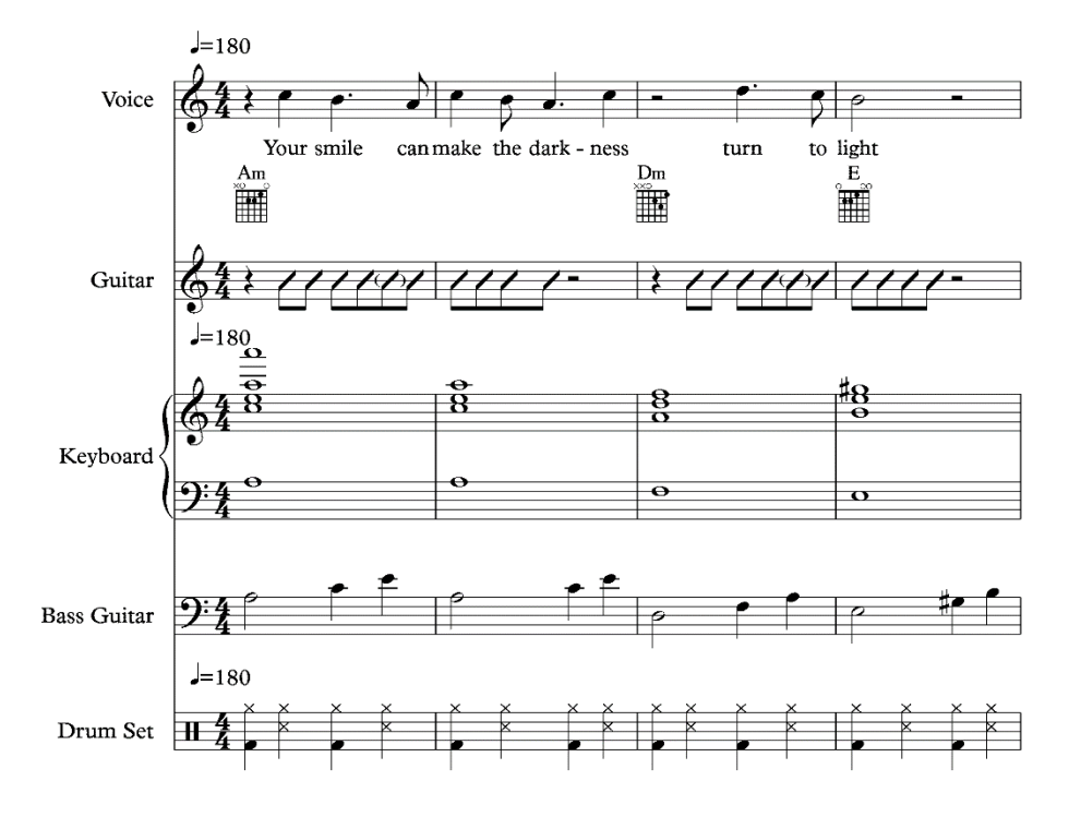
Figure 7: Melody, harmony, instrumentation and rhythm of You've Got What I Like by Gerry & the Pacemakers (1964) (Transcribed from source: Gerry & the Pacemakers, 1964, DB 7189)

The abovementioned adaptation was viewed as a strategy to localise music from the West. Another notable example is the song Tak Mengapa (It's Okay) by the local band A. Rahman Hassan & Orkes Nirwana (1966). The song is an adaptation of You've Got What I Like (1964) by the English band Gerry & the Pacemakers. Both these songs share the same rhythm, and melodic and harmonic accompaniment. The instrumentation is also similar, with the exception of a keyboard replacing the guitar (see Figures 7 and 8). The only differentiating factors are the use of the Malay language in Tak Mengapa and its lyrical theme.