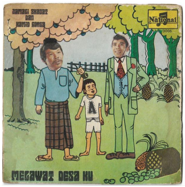
Figure 3: Album cover of Jamali Shadat's Melawat Desa Ku (LMEP 8772) depicting an illustration of a fruit orchard