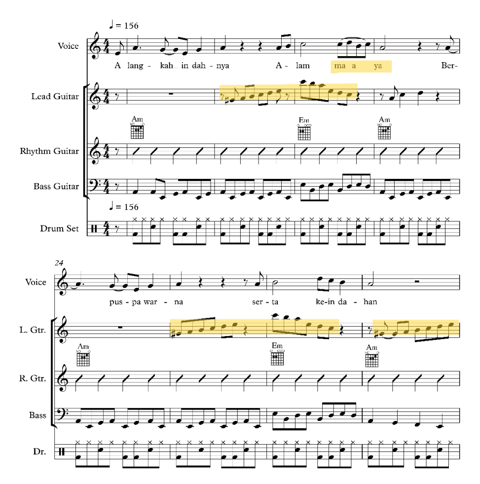
Figure 11: Yale Yale by M. Ishak & The Young Lovers (1967) uses melodic guitar lines and Western harmonies (Transcribed from source: M. Ishak & The Young Lovers [1967, 437804 PE])