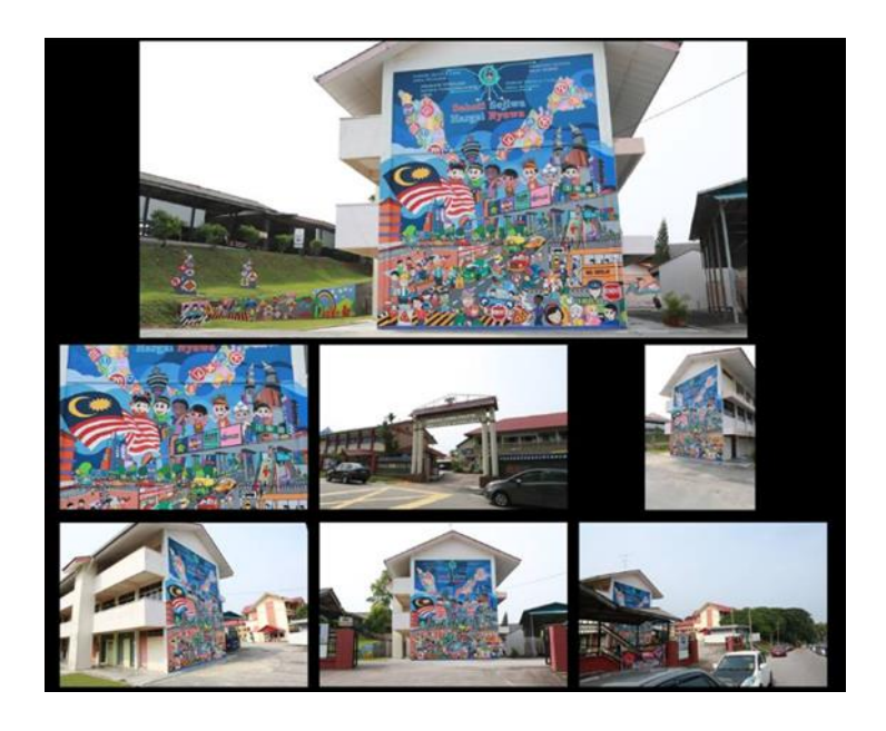
Figure 8. Three level of Mural painting at SMK Kluang Tinggi, Johor

Figure 8 is an example of criteria emphasizing mural scale. Most respondents agreed that scale murals are not a main criterion in this assessment because most informants believe that a large scale will be of no value if the theme, finishing, and art skills are not applied.