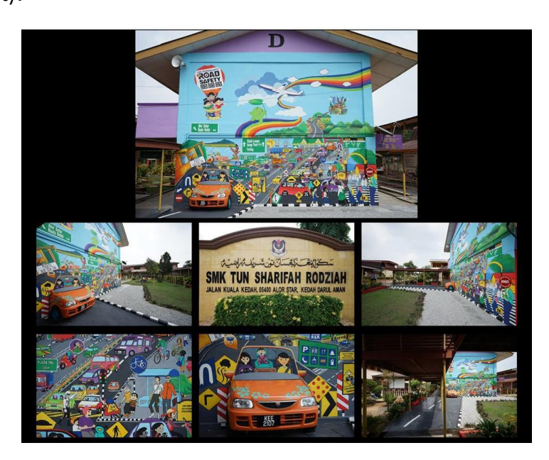
Figure 3 . Mural painting SMK Tun Sharifah Rodziah, Kedah, National Malaysians Unity Road Safety Mural Competition 2016

In contrast, the idea of creativity is presented in Figure 5, where a Curtain flag is hung around the murals to evoke a different atmosphere. Three-dimensional signs affixed to the mural add an interesting element of creativity.