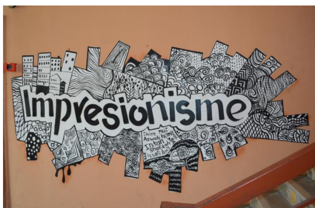
Figure 1. Mural painting SMK Dato Harun, Petaling Jaya.

These responses indicate that theme and message are essential in evaluating mural paintings. Two respondents specifically emphasized that the selection of images and subject matter directly influences the accuracy of the theme and message. This suggests that subject matter is not a separate criterion but an integral part of theme representation.