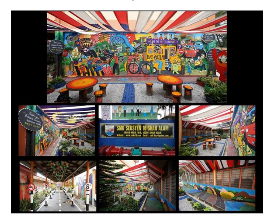
Figure 5 . Mural painting SMK Seksyen 16, Shah Alam, Selangor, National Malaysians Unity Road Safety Mural Competition 2016