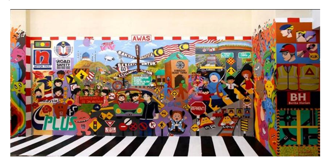
Figure 6 . Mural painting SMK Puncak Alam, Shah Alam, Selangor, National Malaysians Unity Road Safety Mural Competition 2013

Figure 6 is an example of a mural that used bright colours to attract students and children. This mural was awarded the best colour in the Malaysian National Unity Mural Competition Road Safety 2013. (Plus, 2014)