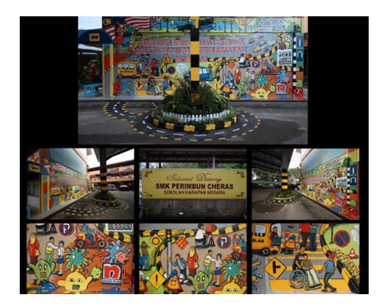
Figure 9. Landscape build in Mural painting SMK Perimbun, Selangor

Through interviews, most experts agreed that the landscape criteria cannot be taken into the mural scoring rubric. Assessment can only be done on mural painting. Landscape is an additional criterion that can help beautify the area around the mural only. Figure 9 shows a mural with the composition criteria evaluation according to the importance of the mural presented in a diagram. Table 3 shows that Expert 1 chose creativity as the most important criterion in a mural painting assessment. This is because the element of creativity benefits the works of art produced by the work of others. This opinion is also supported by Glaveanu (2014), who stated the criteria for creativity can attract an audience should something be created outside of the box. According to Expert 2, if the drawings were made beautifully but did not follow the theme, the result is considered a failure. Normally, the theme is emphasized in a mural contest. Participants must comply with the theme because there is a message to be delivered. Expert 3 chose originality as the most important element in the assessment because, according to the respondent, originality plays an important role as a trademark and identity, elements which indirectly show the mural's high value.