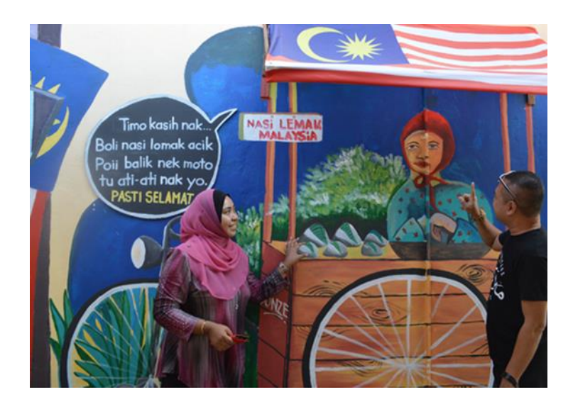
Figure 7. Mural painting SMK Seksyen 16, Shah Alam Selangor