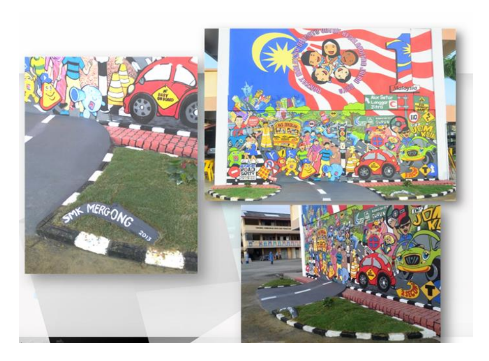
Figure 4 . Mural painting SMK Mergong Alor Setar, Kedah, National Malaysians Unity Road Safety Mural Competition 2014