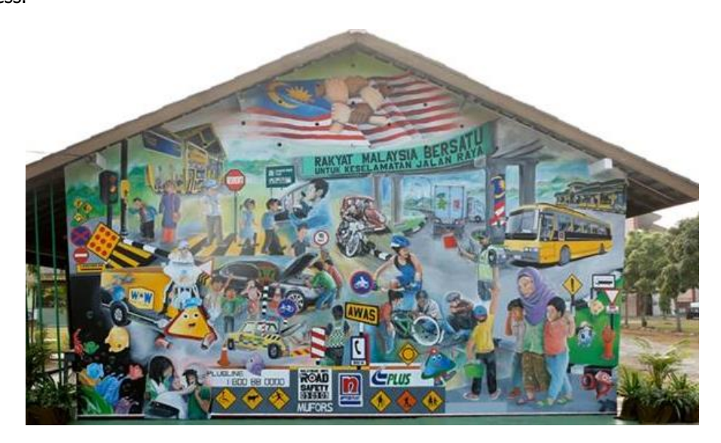
Figure 2 . Mural painting SMK Dato' Mahmud Mat Pekan, Pahang, National Malaysians Unity Road Safety Mural Competition 2013

These responses confirm that subject matter accuracy is not an independent criterion but rather an integral part of conveying the theme and message. The selection of subject matter influences the clarity and effectiveness of the mural's intended message. Figure 2 below illustrates an example of a successful mural that effectively communicates a message to the audience. Each element within the mural contributes to storytelling, enhancing the delivery of the intended message, such as road safety awareness.